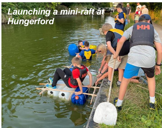
Launching a mini-raft at Hungerford

We went to Hungerford Common again in the summer and had a great time using grass sledges and mountain boards.