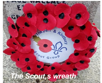
The Scout's wreath

For Remembrance Sunday we made our wreath and thought about Simon Weston and the Falklands War, learning how the Army had changed him from a juvenile tearaway into a National hero who does a great deal of charity work for Young People.