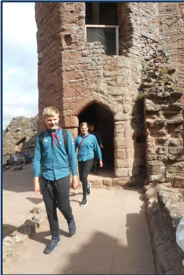
Scouts at Goodrich Castle - at Summer Camp 2022