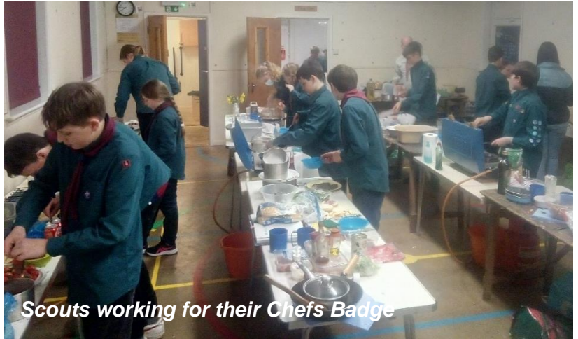
Scouts working for their Chefs Badge

We then learnt about food safety and hygiene before breaking into 9 pairs to cook and serve up fantastic meals for our Chefs Badge. The presentation of the dishes was also brilliant.