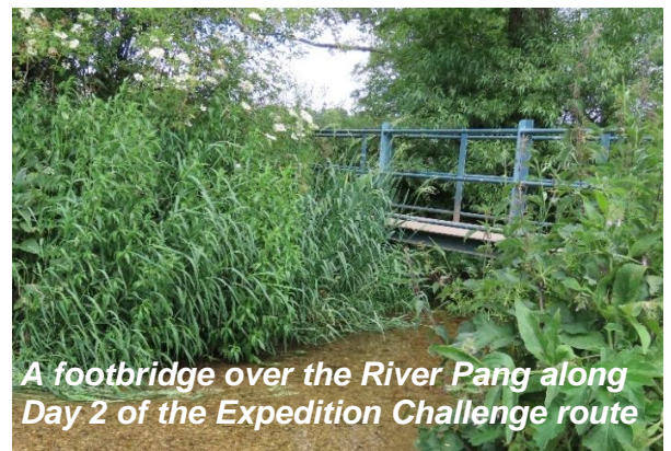
A footbridge over the River Pang along Day 2 of the Expedition Challenge route

We held a presentation for the Expedition Challenge Hike by the older Scouts, who are now of Explorer age, as a result of which they were awarded the Chief Scouts Gold Award which is the highest award in the Scout Section.