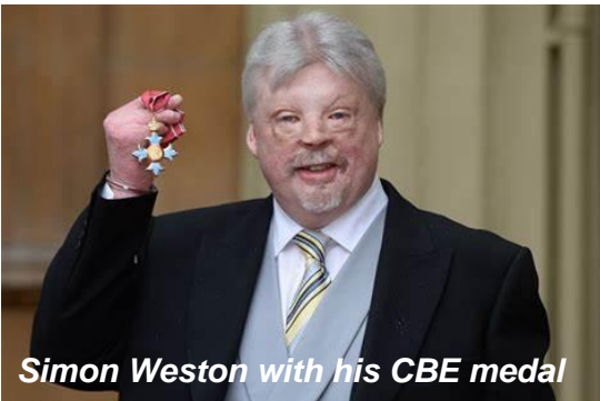
Simon Weston with his CBE medal

Our first meeting back in September was rather sombre as it was the week after the Queen's funeral. We remembered her reign and how she had been a great friend to Scouting for many years.