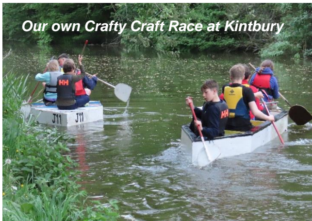
Our own Crafty Craft Race at Kintbury

We went outdoors to Hungerford Common to take part in a Compass exercise and play a wide game in the dark. The Scouts also thought a bit about having a Summer Camp and outdoor activities.