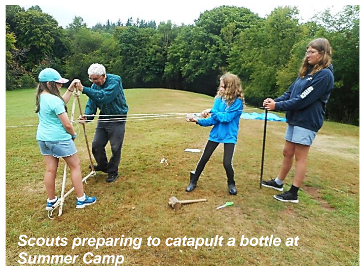
Scouts preparing to catapult a bottle at Summer Camp