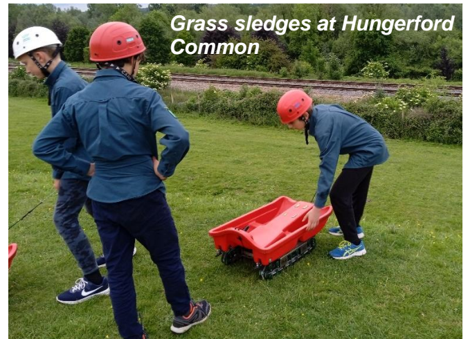
Grass sledges at Hungerford Common

We ended the Summer Term at Hungerford Scout Hut where the Scouts made several mini rafts and paddled them on the canal, before "falling in" to cool off on a blisteringly hot evening.